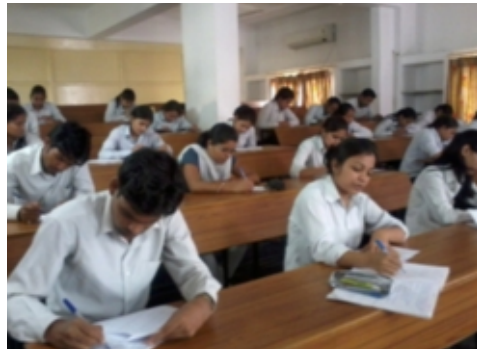
Students during the assessment test

The speaker presented the company profile, discussed about current industry trends touching areas like PHP, Java, .Net, Android,